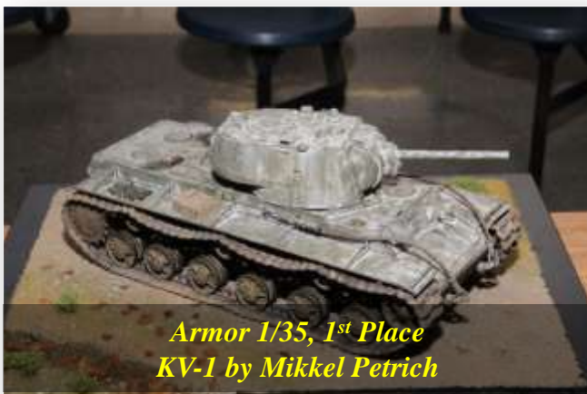
Armor 1/35, 1 st Place KV-1 by Mikkel Petrich