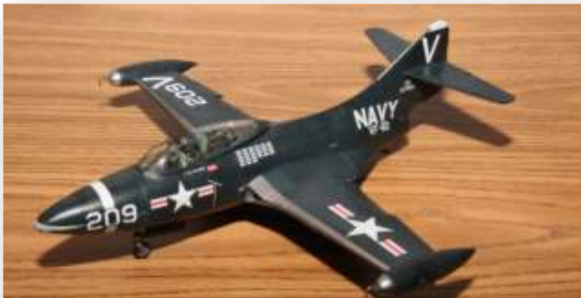
Aircraft 1/48, 1 st Place F-9 Panther by Pat Brown