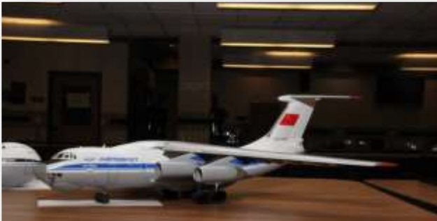
Aircraft 1/72, 1 st Place IL-76MD by Sergei Gural