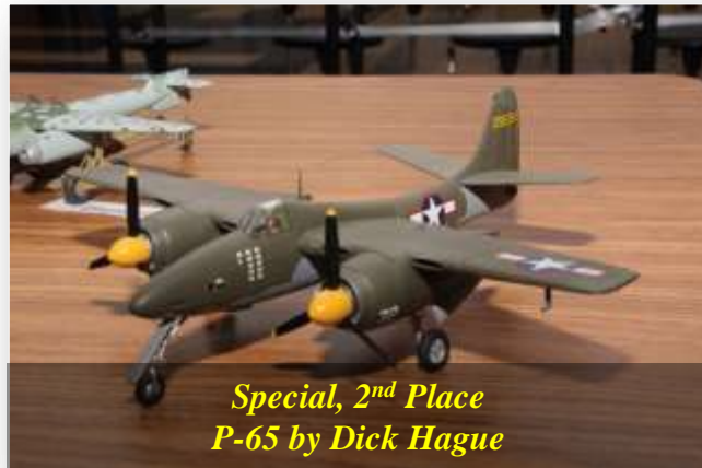
Special, 2 nd Place P-65 by Dick Hague