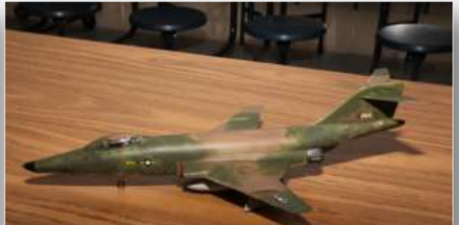
Aircraft 1/72, 2 nd Place RF-101C by Walter Schlueter