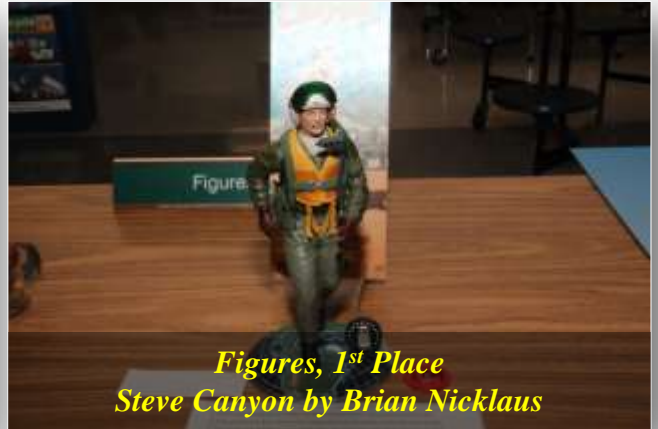
Figures, 1 st Place Steve Canyon by Brian Nicklaus